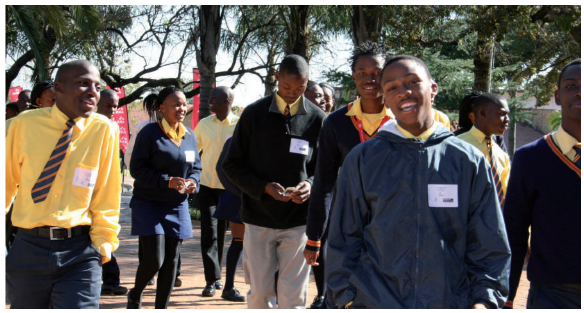
Learners attending the exhibition.

The merSETA joined a career guidance campaign which took place in the Xiholo Village, outside Tzaneen recently. Gwabeni High School in Limpopo hosted the exhibition, which saw scores of learners attending.