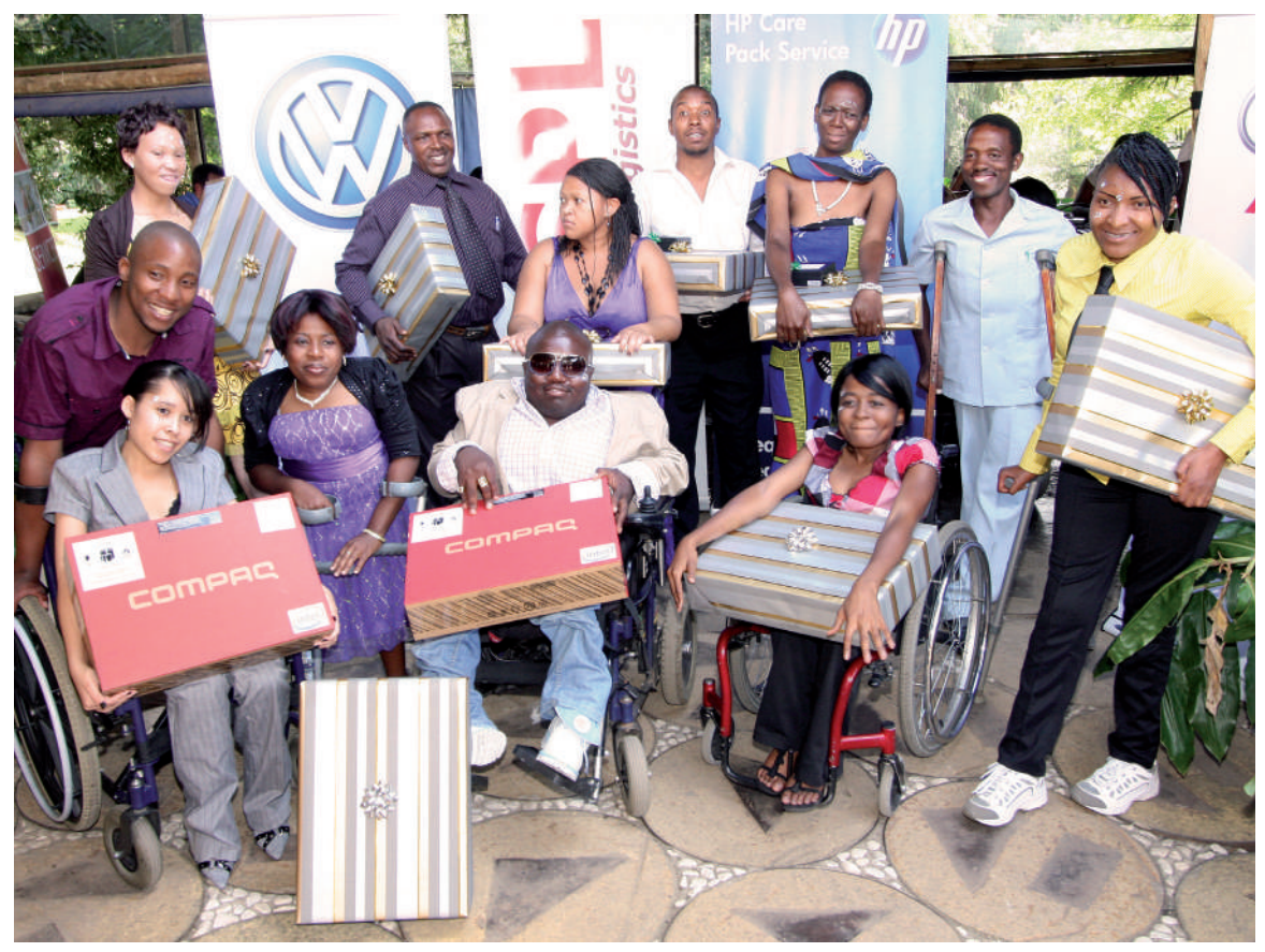
Learners with disabilities graduate after VWSA/merSETA training.

for giving me a chance to live a normal life. Because of them today, I have life, dreams and a future."